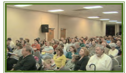
FaithBridge's Project I27Rome Event